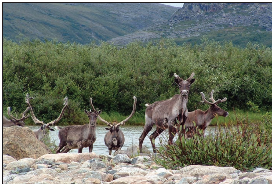
A few members of the Leaf River herd encounter coming down the Riveires aux Feuilles (Leaf River).

LC: (Wildlife) At lunchtime, our peanut butter attracted a bear (kidding; it had no idea we were there until it landed, caught our scent and bolted) to cross the river just 50 metres upstream of us and I got some great footage of it emerging from the river. We rounded another corner and spotted our first caribou and ended up chasing it across the river in an effort to get some good shots, being afraid it’d be our only caribou sighting. Little did we know that over the next few days we’d cross paths with the bulk of the Leaf River herd and would have to stop paddling numerous times to let them pass so close that we would see the whites of their eyes and hear them snorting and the babies bawling with mamas grunting quiet encouragement. We lunched and camped at crossing points and would laugh that we were “missing the parade” when we were distracted by having get on with mundane camp chores. Our nights were disturbed by the clatter of the ever moving herd as our tent blended in amongst the rocks.